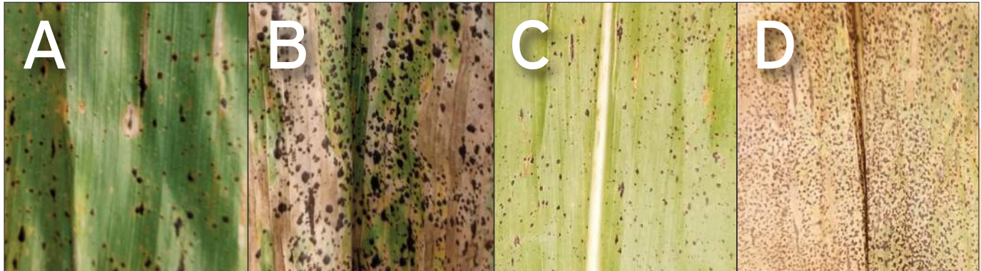
FIGURE 3. TAR SPOT LEAF SYMPTOMS. HYBRID INFECTION RANGED FROM HAVING BOTH STROMA WITH AND WITHOUT HALO (A), LARGE STROMA (B), TO ONLY PIN-POINT STROMA AT LOW 15% (C) TO HIGH 50% (D) SEVERITY.