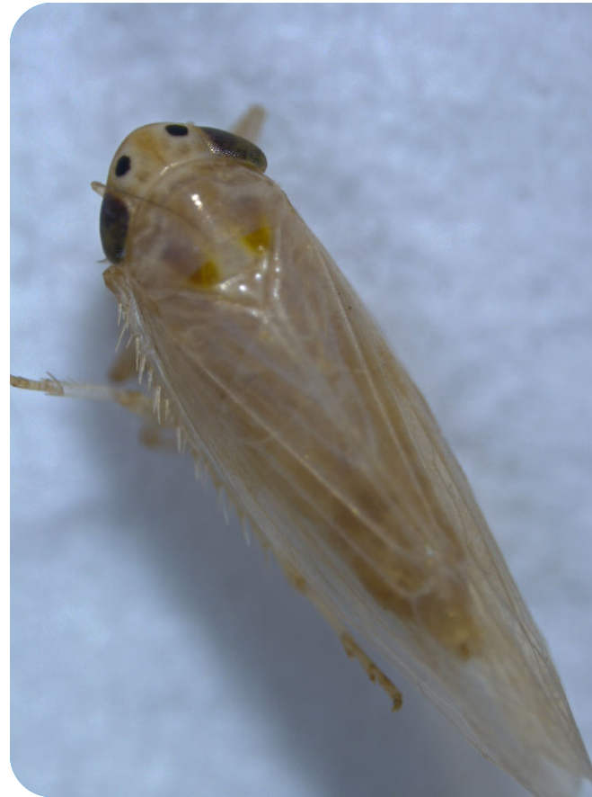
Corn leafhopper with the characteristic two black spots between the eyes.

Overall, the severity of the symptoms will vary depending on when the corn plant was infected.